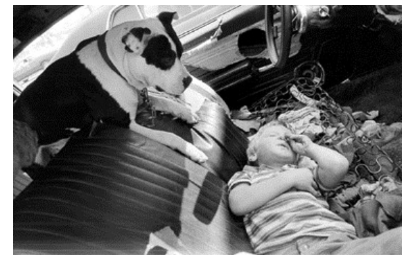
Hawaii Island Homeless Continuum of Care